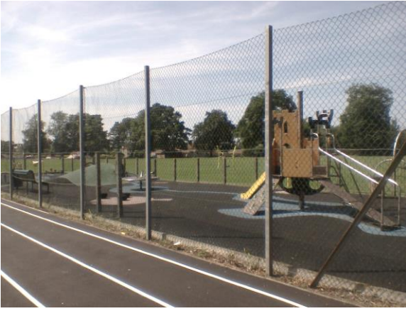
Fence to be upgraded between MUGGA and toddler park.