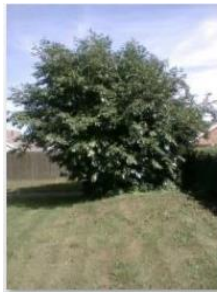
(removal of tree)