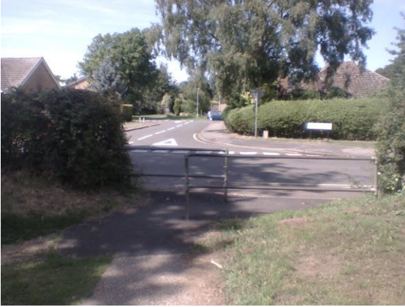
Access point to be kept Haspalls Road