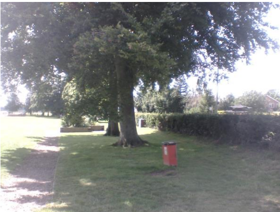
Up pruning of trees required for better surveillance .